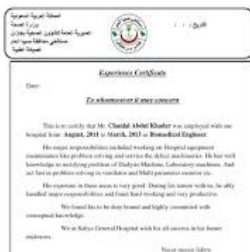
Figure Experience Certificate | PDF