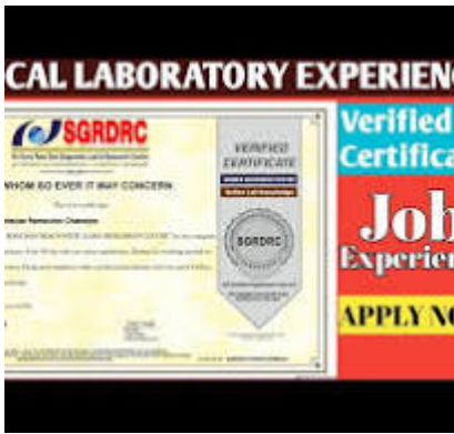
Figure Medical Laboratory experience Certificate | SGRDRC | Varified Experience Certificate | Experience C