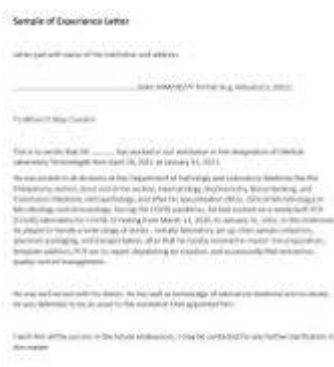
Figure Experience Letter: Definition, Tips and Sample with written text