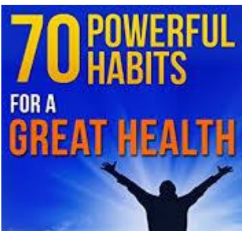
Figure 70 Powerful Habits For A Great Health: Simple Yet Powerful Life Changes For a Healthier, Happier and Slimmer You! See more

Buy Just For Girls Book By: Sarah Delmege , Growing up is a whole lot easier if you know what to expect This just for girls book explains puberty in an easy-to-understand and straightforward way ... secondsale com/p/just-for-girls/1542964