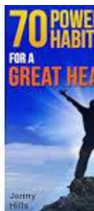
Figure 70 Powerful Habits For A Great Health: Simple Yet Powerful ...

70 Powerful Habits For A Great Health: Simple Yet ... , 70 Powerful Habits For A Great Health: Simple Yet Powerful Life Changes For a Healthier, Happier and Slimmer You! - Kindle edition by Hills, Jenny. amazon.com/Powerful-Habits-Great-Health-Healthier-ebook/dp/B00RY9ZNP