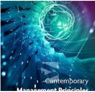
Figure Contemporary Management Principles