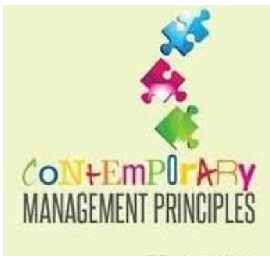
Figure Contemporary management principles | WorldCat.org

Contemporary Management Principles , The contemporary management principles offered in this publication integrates discussions on vital managerial competencies and skills with information on ... juta co za/catalogue/contemporary-management-principles-2e-print_28314