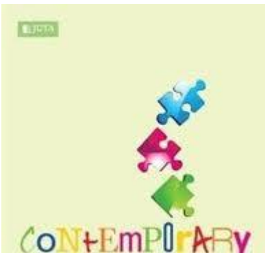
Figure Buy Contemporary management principles Book Online at Low ...