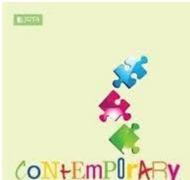
Figure Buy Contemporary management principles Book Online at Low ...