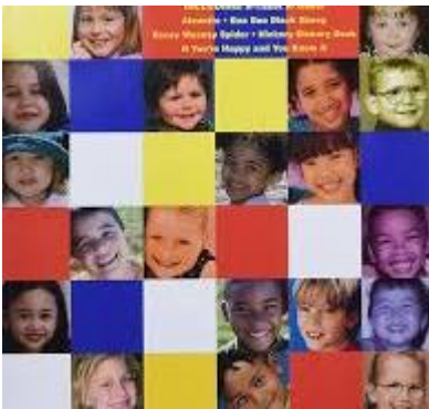
Figure 100 Songs for Kids: Easy Guitar with Notes & Tab

Bengio, Y. (2009) Learning Deep Architectures for AI (PDF) ... , We prove that the Deep Neural Networks implement an expansion and the expansion is complete. First, we briefly review the basic Boltzmann Machine. scirp.org/reference/referencespapers?referenceid=2313133