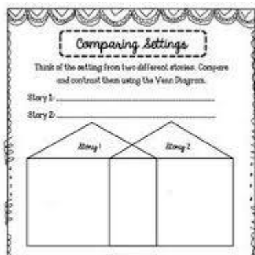
Figure RL3.9 Compare and Contrast Stories by the Same Author ...

Compare & Contrast - Grade 3 Children's Book Collection , Some well-known examples of book series are The Magic Tree House series by Mary Pope Osborne, The Diary of a Wimpy Kid series by Jeff Kinney, Clifford the Big ... getepic.com/collection/27603041/compare-contrast-grade-3