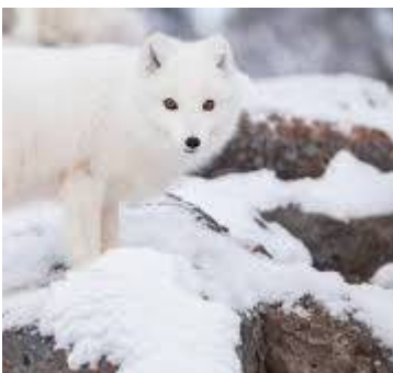
Figure Cute But Tough - The Arctic Fox - Yukon Wildlife Preserve

Arctic fox , en.wikipedia.org/wiki/Arctic_fox