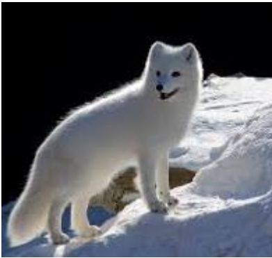
Figure Arctic Fox | National Geographic

Arctic Fox - Fisheries, Forestry and Agriculture , gov.nl.ca/ffa/wildlife/snp/programs/education/animal-facts/mammals/arctic-fox/#:~:text=Arctic foxes live for 3, to 14 years in captivity