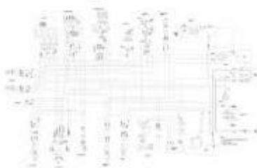
Figure 2000-2009 Arctic Cat ATVs & Snowmobiles OEM Wiring Diagrams Manual Mega PDF of all AC wiring diagrams , Jul 13, 2017 — This chart is designed to direct the technician to the