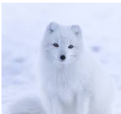
Figure Arctic fox - Wikipedia

Arctic fox | WWF - Panda.org , The arctic fox is an incredibly hardy animal that can survive frigid Arctic temperatures as low as -58^{\circ}\text{F} in the treeless lands where it makes its home. wwf panda org/discover/our_focus/wildlife_practice/profiles/mammals/arctic_fox/#:~:text=The Arctic fox remains the,fox territory in some areas