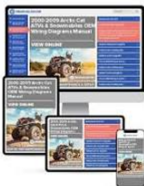
Figure 2000-2009 Arctic Cat ATVs & Snowmobiles OEM Wiring Diagrams Manual Arctic Cat Wiring Diagram Service Manual 2000-2009 ATV ... , Apr 19, 2012 — It is all Arctic Cat wiring diagrams for ATV's and snowmobiles from 2000 thru 2009. It is a big file, 459MB. ebay.com/itm/134213593446