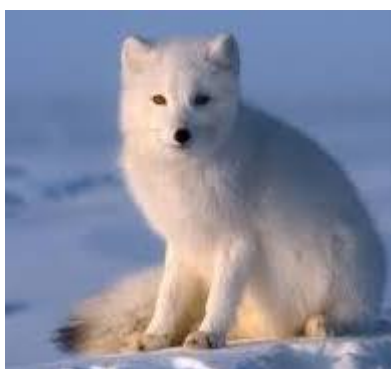
Figure Arctic Fox

Arctic fox | WWF - Panda.org , The arctic fox is an incredibly hardy animal that can survive frigid Arctic temperatures as low as -58^{\circ}\text{F} in the treeless lands where it makes its home. wwf panda org/discover/our_focus/wildlife_practice/profiles/mammals/arctic_fox/#:~:text=The Arctic fox remains the,fox territory in some areas