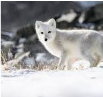
Figure Interesting facts about Arctic foxes | IFAW

Arctic Fox - Fisheries, Forestry and Agriculture , gov.nl.ca/ffa/wildlife/snp/programs/education/animal-facts/mammals/arctic-fox/#:~:text=Arctic foxes live for 3, to 14 years in captivity