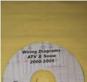
Figure Arctic Cat Wiring Diagram Service Manual 2000-2009 ATV Snowmobile ZR 500 650

Arctic Cat All Atv and Snowmobile 2000 - 2009 Wiring ... , Apr 5, 2014 — Unfortunately Country Cat only has wiring diagrams back to 2000 for sleds. I have a generic 90-98 manual for Cats and there's not an EFI harness diagram in it. tradebit.com/filedetail.php/175894842-arctic-cat-all-atv-and-snowmobile-2000