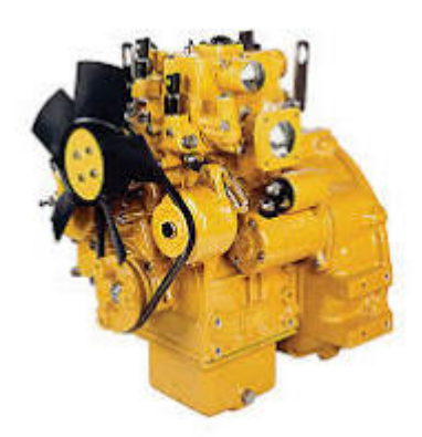
Figure C0.5 Industrial Diesel Engines | Cat | Caterpillar

CAT C7 Specs and Engine History - Capital Reman Exchange, 38-72 L (40-76 qt). Engine Dimensions (Approximate. Final dimensions dependent on selected options). Page: M-1 of M-5. © 2017 Caterpillar All Rights Reserved. capitalremanexchange com/cat-c7-specs-and-engine-history/#:~:text=C7 Dimensions and Operating Capabilities, sump pump and oil pan