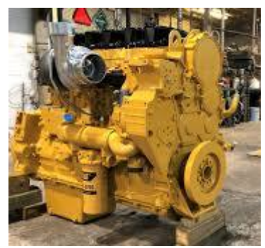
Figure Building New Caterpillar Diesel Engines and Running Old Junk Ones

Engine is offered in ratings ranging from 354-433 bkW (475-580 bhp). @ 1800-2100 rpm. These ratings meet U.S. EPA Tier 4. atldiesel com/blogs/news/how-to-get-more-power-out-of-your-3406b-catengine#:~:text=General Specs of the 3406B CAT Engine&text=The 3406B Caterpillar engine is,a height of 58 04 inches