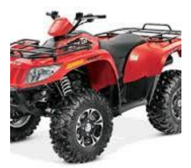
Figure 2015 Arctic Cat 1000 XT EPS - 951cc Special Notes, Prices ...

more online or call at ... arcticcatpartshouse com/oemparts/l/arc/57d19e0b87a86612c88cb358/2017-1000-xt-eps-white-a2017agw1pusw-parts