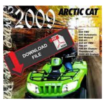
Figure Arctic Cat 2009 ATV 1000 H2 EFI TRV Cruiser 4x4 Service Manual

Figure Arctic Cat 2009 400 500 550 700 Thundercat 1000 ATV Service Manual CD 2258-380 2009 Arctic Cat 700 H1 700H1 ATV Service Repair Manual , Oct 30, 2017 — 2009 Arctic Cat 700 H1 700H1 ATV Service Repair Manual - Download as a PDF or view online for free. slideshare net/slideshow/2009-arctic-cat-700-h1-700h1-atv-service-repair-manual/81397112