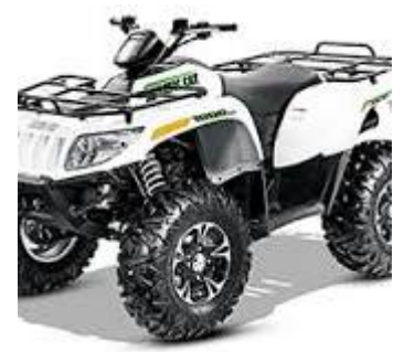
Figure 2017 Arctic Cat 1000 XT EPS - 951cc Prices and Values | J.D. ...

Cat C9 DIESEL GENERATOR SETS, foleying com/content/uploads/2020/03/updated-LEHE1569-00 pdf