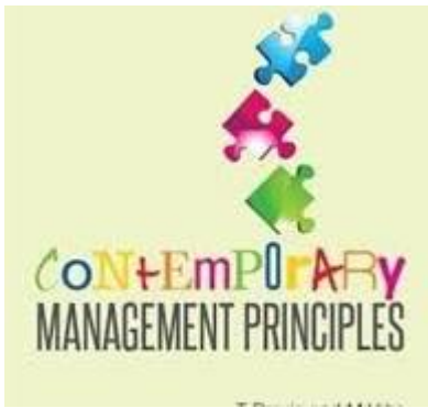
Figure Contemporary management principles | WorldCat.org

A Contemporary Edition For Africa 6e by PJ Smit, T Botha ... , Self-assessment questions. Management Principles: a contemporary edition for Africa is written from a South African and African perspective. The uniqueness of ... scribd.com/document/632096670/Management-Principles-A-contemporary-edition-for-Africa-6e-by-PJ-Smit-T-Botha-and-MJ-VRBA-z-lib-org-pdf