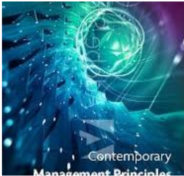
Figure Contemporary Management Principles

Jual Contemporary Management Terlengkap - Harga ... , tokopedia.com/find/contemporary-management