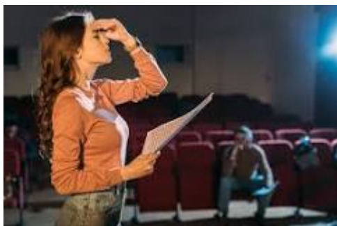
Figure Best Monologues for Auditions | Backstage

What makes a perfect monologue? Good monologues are structured just like good stories: they have a beginning, a middle, and an end. This rhythm—a build up and a resolution—is critical in long stories, because without it, stories can become monotonous and stale.