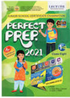
Figure Lecture Guide For Class Eight (5 Parts)

Lecture Guide Class 5 - ?????? ???? ?????-?, ?????? ???? ?????-?, , Edition: 2024, Price: Tk 800.00, Publisher: Lecture Publication, Bangladesh, Subject: ????? ?????? Class Five. eboighar.com/en/booksdetails/63029