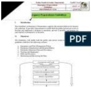
Figure DM-PH&SD-P7-WI18 - (Health Requirements For The Services ...

Technical Guidelines for Labor Accommodation Compliance , Environmental health compliance in labor accommodation. A. Public Health and ... Establishment's violations to the environmental health requirements ... dm gov ae/wp-content/uploads/2021/05/DM-HSD-GU85-LAC2-_Technical-Guidelines-for-Labor-Accommodation-Compliance_v1 1 pdf