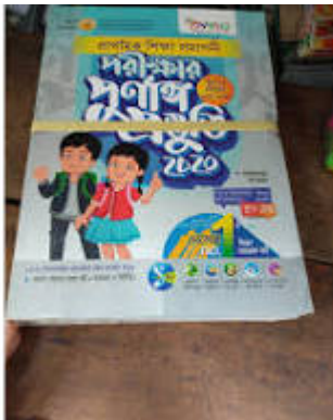
Figure Guide Book For Class Five

Class 5 Guide Book 2024 - Apps on Google Play , Assalamu Alaikum, dear students, how are you all? Come on everyone is fine. Guide for class 5 has all the subject guide chapters arranged separately. play google com/store/apps/details?id=com classnotebd class five math solutions&hl=en_US