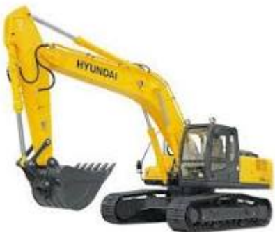
Figure Hyundai Robex 290LC-7A / R290LC-7A Crawler Excavator Repair Service Manual HYUNDAI ROBEX R200W-2 WHEEL Excavator Service ... , HYUNDAI ROBEX R200W-2 WHEEL Excavator Service Manual book repair shop book guide ; Condition. Acceptable ; Quantity. 1 available ; Item Number. 195453247866. ebay.com/itm/195453247866 Hyundai Wheel Excavator Robex 200W-7 R200W-7 ... , This Service and Repair Manual Covers the following Models: - Hyundai Robex 200W-7 ... Hyundai Wheel Excavator Robex 200W-7 R200W-7 Workshop Service Manual. catexcavatorservice.com/wp-content/uploads/2015/10/Hyundai-Wheel-Excavator-Robex-200W-7-R200W-7-Workshop-Service-Manual-pdf Hyundai R200W 7 PDF Crawler Excavator Workshop ... , Jul 6, 2023 — This document provides specifications and safety information for the Hyundai R200W-7 crawler excavator. slideshare.net/slideshow/hyundai-r200w-7-pdf-crawler-excavator-workshop-service-manualpdf/258980584 Hyundai R200W-7 Wheel Excavator Service Repair Manual , This is the COMPLETE Service Repair