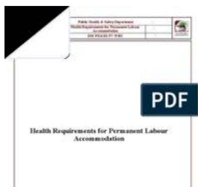
Figure Health Requirements For Permanent Labour Accommodation ...

What is the new Labour law for housemaid in UAE? Employment Conditions, Leaves, and Remuneration: Article 9 of Federal Decree-Law No. 9 of 2022 and Articles 7 and 8 of Cabinet Resolution 106 of 2022 ensure that Domestic Workers receive a paid day off every week. A daily rest period of at least 12 hours, including a continuous 8-hour sleep, is mandated.