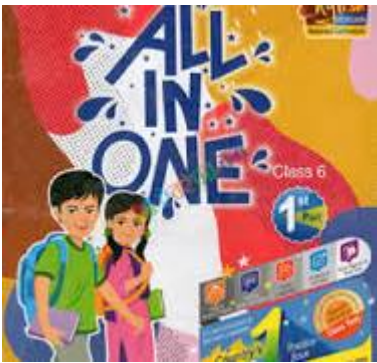
Figure Lecture Guide Class 5 English Version - ?????? ???? ????? ? ????? ?????? | Buy Book Online - ??????? ?? ?????? | eBoighar.com

Class 5 Guide Book 2024 - Apps on Google Play , Assalamu Alaikum, dear students, how are you all? Come on everyone is fine. Guide for class 5 has all the subject guide chapters arranged separately. play google com/store/apps/details?id=com classnotebd class five math solutions&hl=en_US