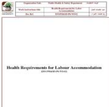
Figure ENG - DM-PHSD-P6-WI-02 Health Requirements For Labor ...

Technical Guidelines for Labor Accommodation Compliance , Environmental health compliance in labor accommodation. A. Public Health and ... Establishment's violations to the environmental health requirements ... dm gov ae/wp-content/uploads/2021/05/DM-HSD-GU85-LAC2-_Technical-Guidelines-for-Labor-Accommodation-Compliance_v1 1 pdf