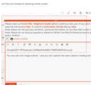
Figure Unable to click export icon in SAP - Activities - UiPath ...

Download icon image file to pc sap practical tips ... , Sign in. Loading... docs google com/file/d/1tWkrdqbPAIePnd3C7W5aWrNDBNPQrKol/