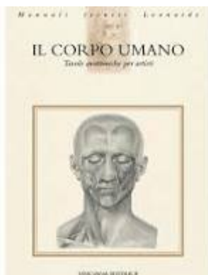
Figure Vinciana Editrice - Il corpo umano - Tavole anatomiche per ...

Cosa ha scoperto Falloppio? Observationes anatomicae di Falloppio Con la pubblicazione delle sue Observationes anatomicae nel 1561, Falloppio indagò la struttura dell'orecchio, quello delle ossa e degli organi, nonché l'apparato riproduttore, scoprendo poi la configurazione l'esatta delle trombe uterine che presero quindi il suo nome.