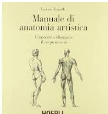
Figure Amazon.it: Il corpo umano. Tavole anatomiche per artisti - Libri

IL CORPO UMANO: TAVOLE ANATOMICHE PER ARTISTI ... , 7 Mar 2022 — Ogni singola tavola presenta la numerazione, l'indicazione della parte illustrata e la sua nomenclatura anatomica; in tal modo l'utilizzo delle ... artislireblog.com/il-corpo-umano-tavole-anatomiche-per-artisti-in-un-prezioso-volume/