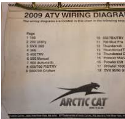
Figure 2258-411 OEM ARCTIC CAT 2009 ATV Wiring Diagrams

Mega PDF of all AC wiring diagrams , Jul 13, 2017 — This chart is designed to direct the technician to the appropriate Main Harness Wiring Diagram and Hood Harness Wiring Diagram. arcticchat.com/threads/mega-pdf-of-all-ac-wiring-diagrams-318342/