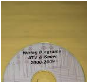
Figure Arctic Cat Wiring Diagram Service Manual 2000-2009 ATV Snowmobile ZR 500 650

Arctic Cat All Atv and Snowmobile 2000 - 2009 Wiring ... , Apr 5, 2014 — Unfortunately Country Cat only has wiring diagrams back to 2000 for sleds. I have a generic 90-98 manual for Cats and there's not an EFI harness diagram in it. tradebit.com/filedetail.php/175894842-arctic-cat-all-atv-and-snowmobile-2000