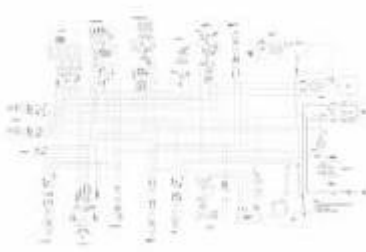
Figure 2000-2009 Arctic Cat ATVs & Snowmobiles OEM Wiring Diagrams Manual

Mega PDF of all AC wiring diagrams , Jul 13, 2017 — This chart is designed to direct the technician to the appropriate Main Harness Wiring Diagram and Hood Harness Wiring Diagram. arcticchat.com/threads/mega-pdf-of-all-ac-wiring-diagrams-318342/