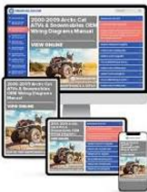
Figure 2000-2009 Arctic Cat ATVs & Snowmobiles OEM Wiring Diagrams Manual

Arctic Cat 2000 Thru 2009 Atv and Snowmobilesnow ... , This is a Wiring Diagram Manual CD that has ONLY Wiring Diagrams. Covers ALL snowmobiles and UTVs from 2000-2009. # 2258-719. scribd com/document/657120963/Arctic-Cat-2000-Thru-2009-Atv-and-Snowmobilesnow-Wiring-Diagrams